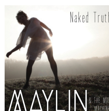
«Naked Truth» (2017)