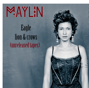
«Eagle Lion & Crows» (2016)