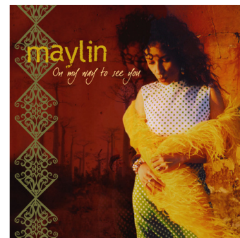
«On My Way To See You» (2005)

Contact : Before June +33/(0)6 78 62 68 67, contactbeforejune@yahoo.fr