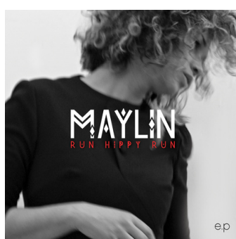
«Run Hippy Run» (2013)